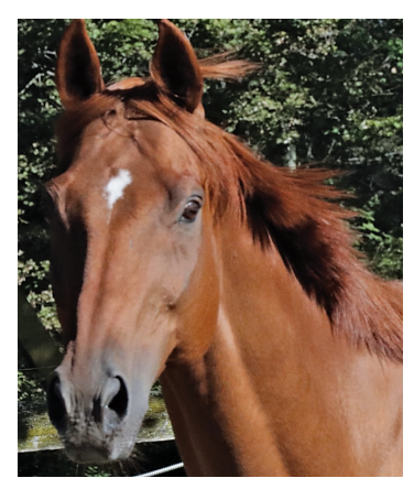
Philotimo, ten years later, still enjoying life at Little Brook Farm.

Sadly, an Albany Times Union investigation (see article on NYSHA's website) informs us that we, the citizens of NYS, are supporting this cruelty. How? We, as citizens, own the property and facilities where the three Thoroughbred tracks operated by the New York Racing Association (NYRA) are located. We pay the property taxes. And though NYRA has a lease agreement with the state, NYRA pays no rent. In addition, the state provides NYRA with a portion of the income from various video lottery terminals owned by the state – income that could instead be used to fund education and veterans' programs; income that could help reduce the amount of taxes we pay. Lastly, to encourage Thoroughbred owners to participate in the NYS racing industry, millions of dollars in racehorse sales, as well as transactions related to horse maintenance and equipment, are free of state sales taxes. Is this fair? Does it matter?