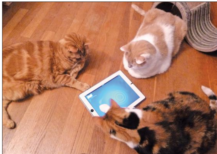
Entertaining cats with technology.

NYSHA encourages cat parents to keep their cats inside so there is no risk of their succumbing to motor vehicles or cruel humans. Following Ohio State University’s “Indoor Pet Initiative,” we can protect our cats from dangers in the