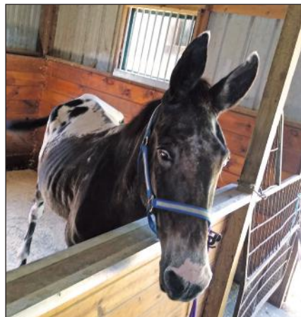
Randy on arrival, with visibly prominent spine and ribs.

An area veterinary clinic was called to do a hands-on evaluation. The veterinarian determined the mare needed to be euthanized as soon as possible, as she was beyond recovery, but the mule stood a chance. The owner agreed to surrender the two animals to the authorities, and NYSHA secured the services of a veterinarian for the mare to be relieved of her suffering the next day. But who would take an old emaciated mule?