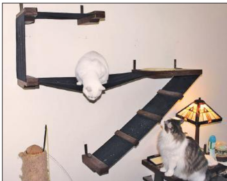
Cats playing on wall gym.

As birds’ numbers decline dramatically, conservationists beg cat parents to keep their cats inside, while cat lovers want their companion to enjoy the outdoors; they deny that their cat has any real effect on population numbers, blaming the dwindling numbers of birds on loss of habitat, collisions with motor vehicles, toxic environments, manufacturing, etc., all of which are additional factors that drive avian population numbers down. The American Bird Conservancy ( abcbirds.org ) states that the over one hundred million feral and outdoor cats in the USA are responsible for the deaths of 2.4 billion birds annually. Their website contains information on bird species driven to near-extinction by cat predation, and begs us to stop creating TNR (Trap, Neuter, Return) programs that encourage more predation and loss of wildlife.