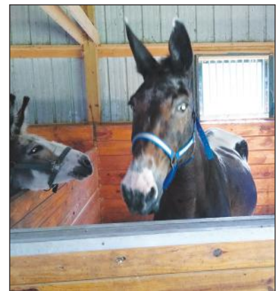
Pedro looking for a friend.

That hope was justified. Randy is steadily improving and when completely rehabilitated, he may become a service animal with an organization in Sullivan County that has rehabilitative programs for children and adults. Randy, though large, is gentle and likes people. Because of a problem with one leg that had not been treated properly in the past,