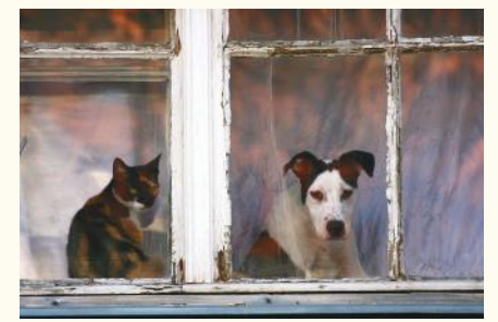
In the past, animals such as these were often left behind after an eviction.