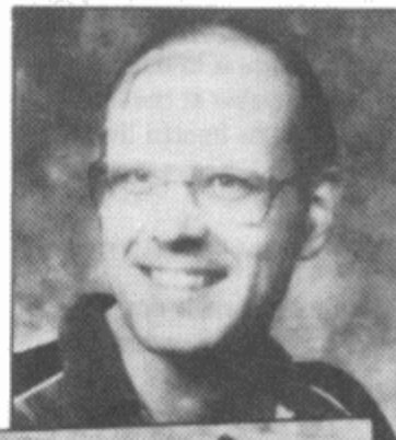
Four of the most famous violent criminals in recent years had histories of abusing animals: (top left to right) Edmund Emil Kemper III; David Berkowitz; James Oliver Huberty; and (below) Albert DeSalvo.