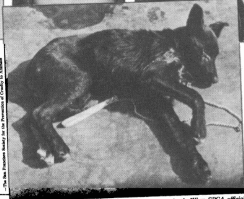
Witnesses said a San Francisco man kicked this puppy to death. When SPCA officials checked police files to see if the accused had a prior criminal record, they discovered he was also wanted on a felony charge. The man later was found guilty of a violent crime and sentenced to the state penitentiary. The link between violent behavior and animal abuse is only now coming to the attention of many in the criminal justice system.

—The San Francisco Society for the Prevention of Cruelty to Animals