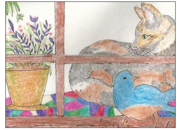
Cats inside, birds outside -- keeps everyone happy and safe. Drawing by the late Julie Tanner, dedicated animal advocate.

The best time to feed these animals is early in the morning to give them nourishment and energy for their day, and late in the afternoon for extra calories to help them keep warm during the night. Feeding them all is a simple way to thank them for being there for us.