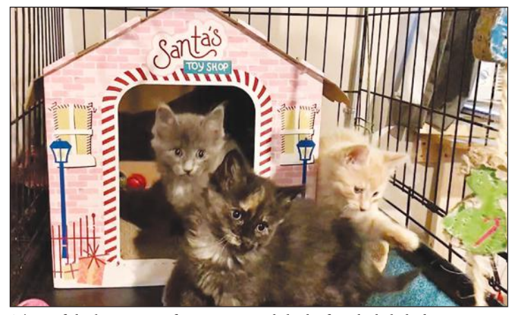
Three of the kittens pose for a picture, while the fourth shyly hides.

The volunteer was stunned the next morning when she opened the door to the room where she was keeping the cat -- she was greeted with soft mewing sounds. The cat was lying on her side with four kittens beside her. The volunteer stood there in shock; she had not yet checked the sex of the cat. Who would have thought that this poor emaciated cat was pregnant, let alone, ready to give birth? Yet, during the night, four seemingly normal kittens were born who were now happily nursing on their mother's small, thin body.