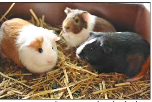
Guinea pigs enjoy the companionship of each other.