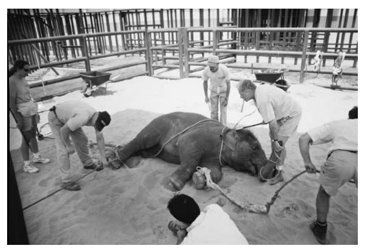
Harsh and frightening training methods being used on a baby elephant.

The saddest images available through the People for the Ethical Treatment of Animals' website show the very young babies taken from their mothers early so that they can learn the fear of humans and the pain that human handlers can inflict at a very early age, while our species is still able to dominate them ("Elephants in Circuses: Training and Tragedy".) They are shackled and shocked, stabbed with the ankus' sharp tip, spread-eagled on the ground to learn how helpless they are, forced to sit on tubs and do headstands—essentially to perform all the unnatural and uncomfortable tricks they will be forced to display as adult performers, or suffer excruciating pain. All this abuse delivers the desired final product — an animal too frightened and psychologically crushed to do anything but obey, so that the public is duped to think that their