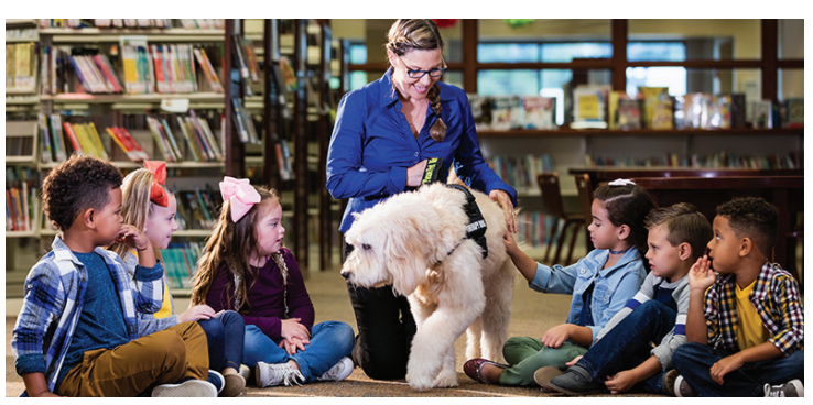
Humane Education can take place in many settings.

The most effective method for fostering humane education is for teachers to incorporate it as much as possible into their class curricula, since children spend many hours each day at school and the teacher is a role model and authority figure. There are many